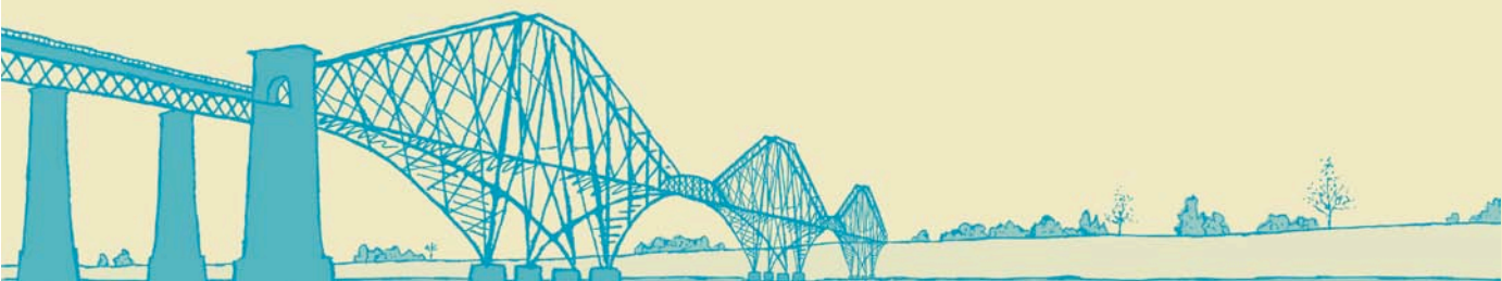
Forth Rail Bridge

Balfour Beatty promotes, develops and invests in privately funded infrastructure assets in selected sectors, on an international basis.