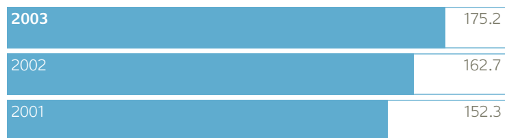
Group profit before taxation and exceptional items (£m)